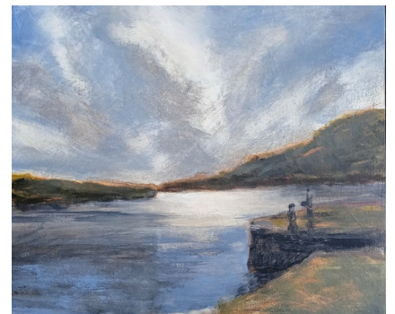
Cotehele