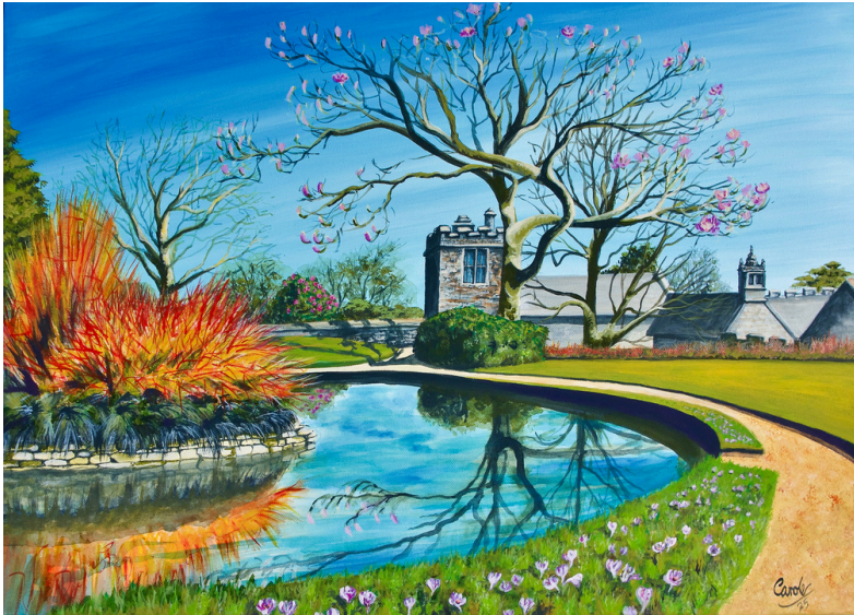
Equinox by Carole Cox

Open each day until Sunday 9 June, 12pm to 4pm.