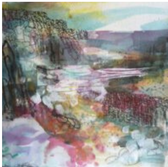
Long Peak Beach