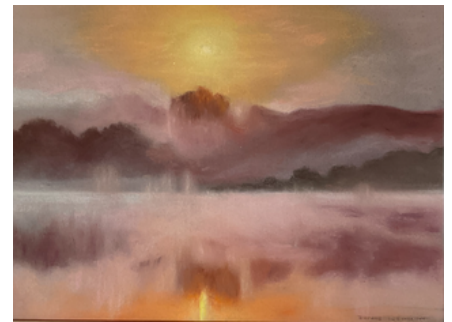
Last reflections by Daphne Leeworthy