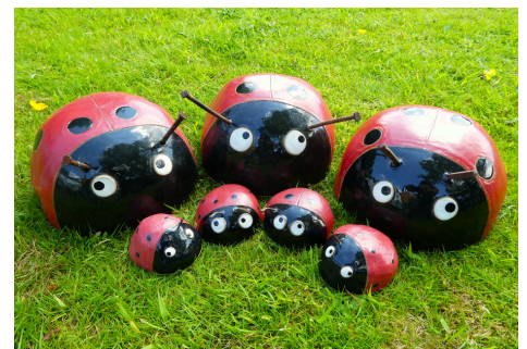
Ladybirds