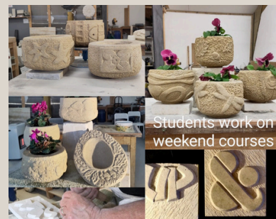
Students work on weekend courses