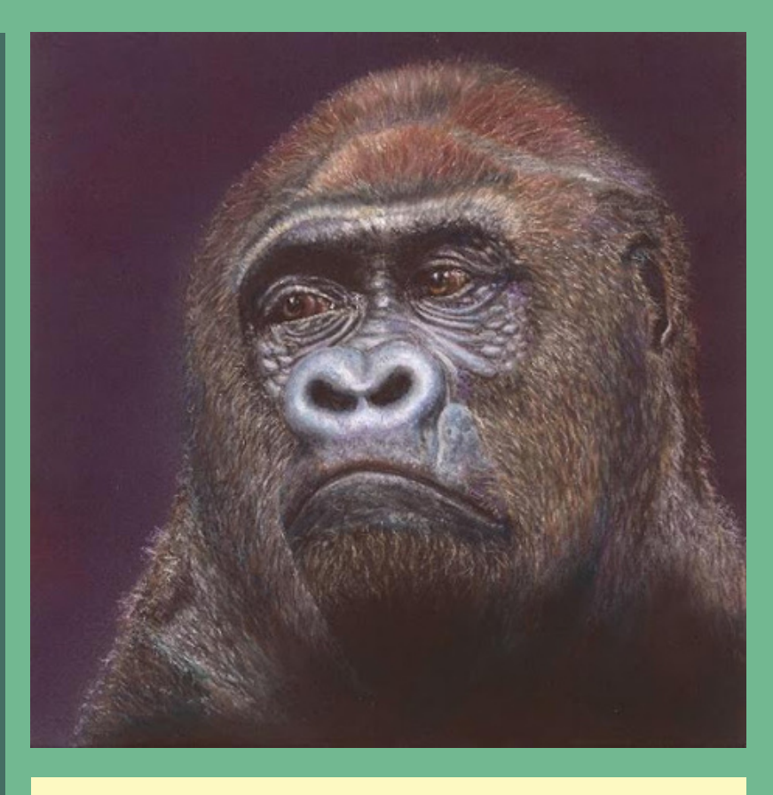
Gorilla 'Don't mess with my habitat'