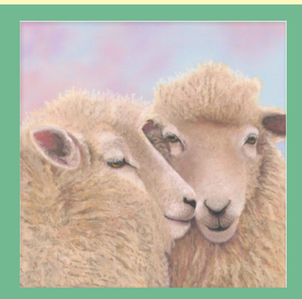
'Love Ewe Too'