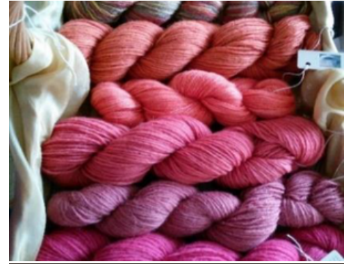
JANE DEANE – Textiles