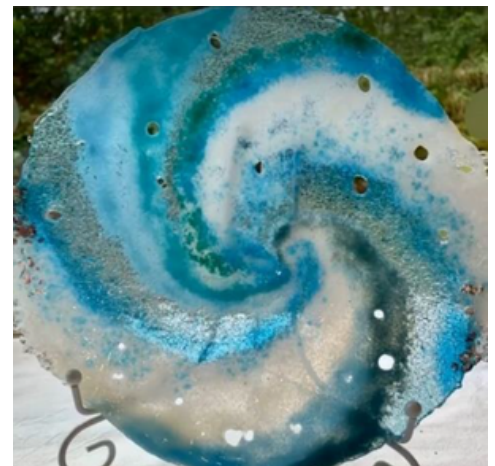
SUE JOHNS – Glass