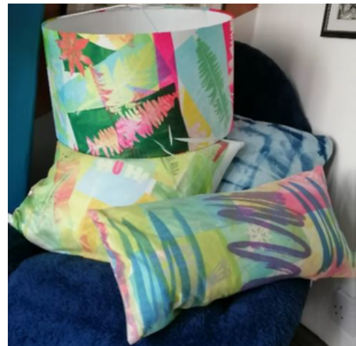
DIANA THOMPSON – Textiles