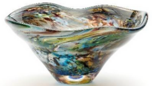
IAN PALFREY – Glass