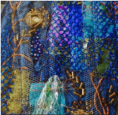
BEV MOODY – Textiles