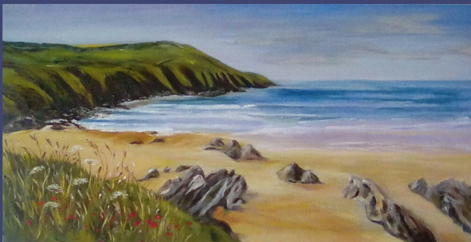
ABOVE: Summer Sea'