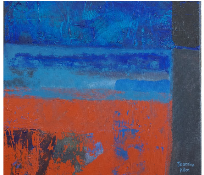
RED CENTRE (2017)

I love the play of light on landscapes. I enjoy painting places I have stayed, such as Italy, Provence and Morocco, each of which has its own tonal spectrum, different from England. Recently, I enjoyed recalling the bold colours of the wild centre of Australia