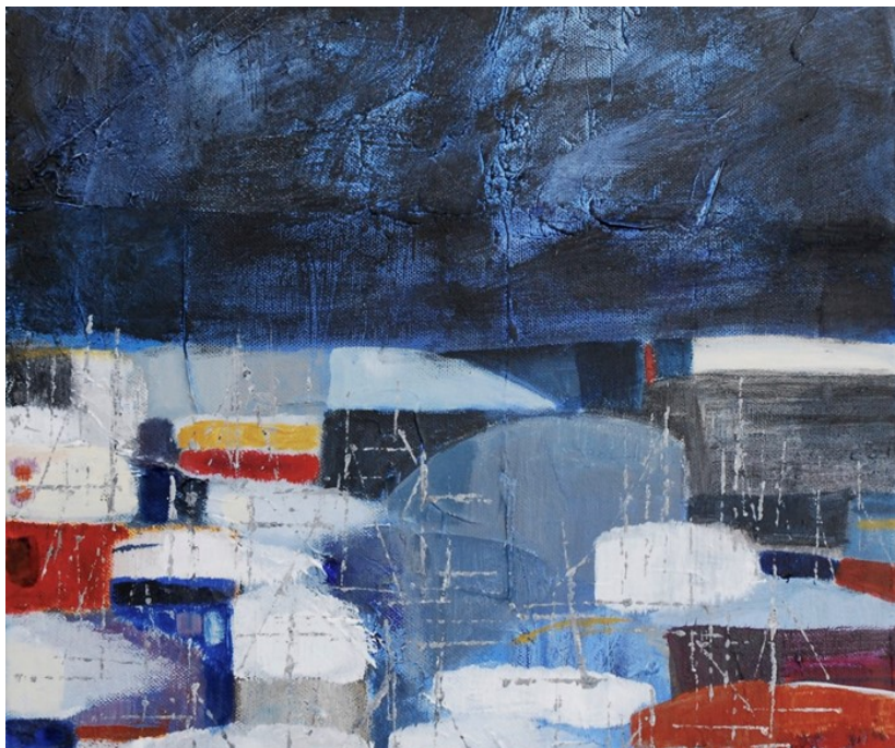
OUT OF THE STORM