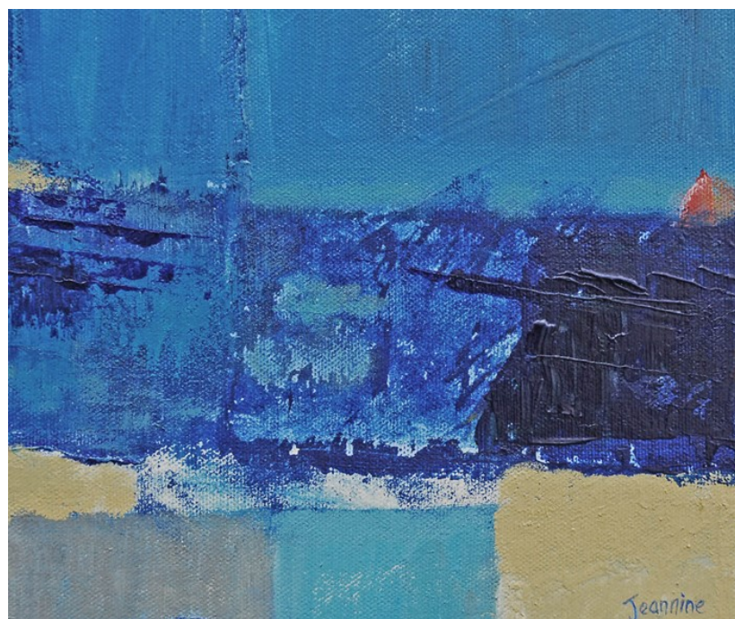
Above: RED SAIL

Right: COLLAGE (blue palettes) a collage which I created using bits of my old palettes.